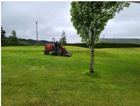
Rough mowing #1 tee surrounds

The month of June might have been one of the wettest Junes that I have ever seen on the golf course. I was able to go almost the whole month without irrigating due to the unusually wet weather. The downside to it is that the grass would usually be slowing down, but instead it’s growing like it’s early spring. Due to the circumstances the crew has had to spend most of their time trying to keep up with mowing. Even with the unusual weather