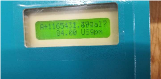
Strap-on meter now chugging out data