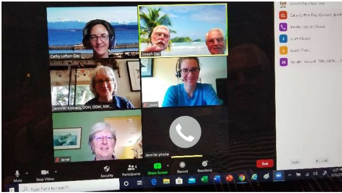
Presenting Water Project Reserve Study to State which resulted in a $40,000 savings for Camaloch