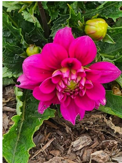
One of the new border dahlias starting to bloom on #10 tees

curtain drains. Hopefully I will have some better answers of what is causing this in next month’s update.