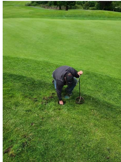
Cleaning sprinkler heads

We finished up the month with trying to figure out where the mysterious water is coming from left of the number 5 green. The crew has dug back some of the hill side in an attempt to find some answers. For now, we have the area marked as ground under repair and are capturing the runoff in one of the number 5 green’s