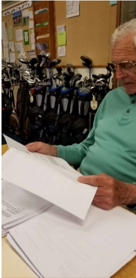
Marty slogs through 3 years of invoices from Coffman Engineering to make sure Camaloch is tracking our 2.5M investment