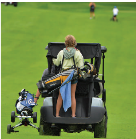
Lilly Taylor catches a ride to hole 4.