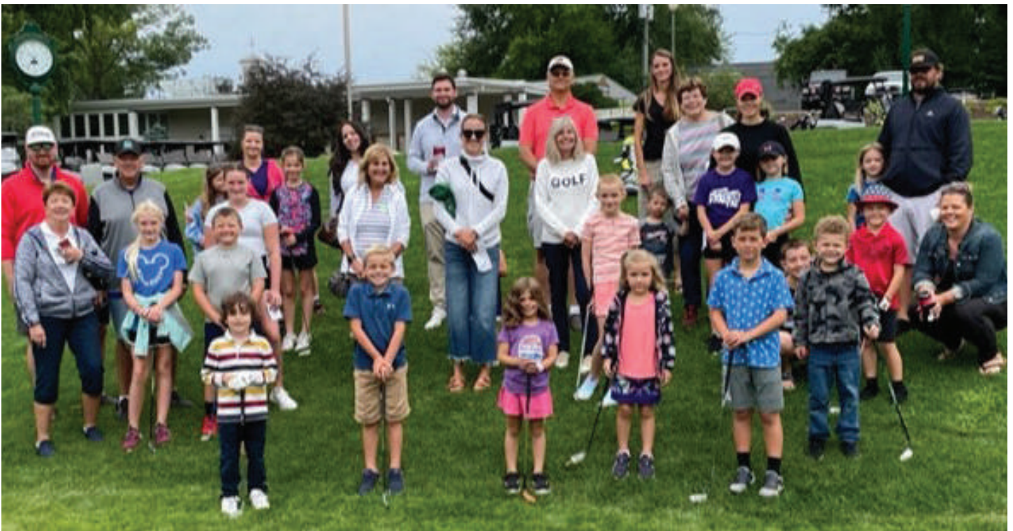
Junior Club Championship participants! It was a great day!

Thanks to the many parents, grandparents, and caregivers, who helped with scoring and caddying for the kids.